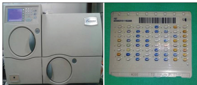
Figure 2: Automated Vitek 2 Compact System and YST 2 identification cards

Six types of candida species; C. albicans , Candida famata , Candida ciferri , C. tropicalis , Candida gulleri , C. krusei , Candida glabrata were identified. The distribution of candida species; C. albicans , C. tropicalis , C. krusei , C. glabrata was 2 (4%), 7 (14%), 4 (8%), 1 (2%) in Group I, 20.8 (40%), 7 (14%), 34 (68%), 14 (28%) in Group II, and 6 (12%), 2 (4%), 1 (2%), 2 (4%) in Group III subjects ( P = 0.00001 ), that was highly significant and none of the subjects showed isolates of C. famata , C. ciferri , C. gulleri . Thus, Color Media identified all the species correctly with “good