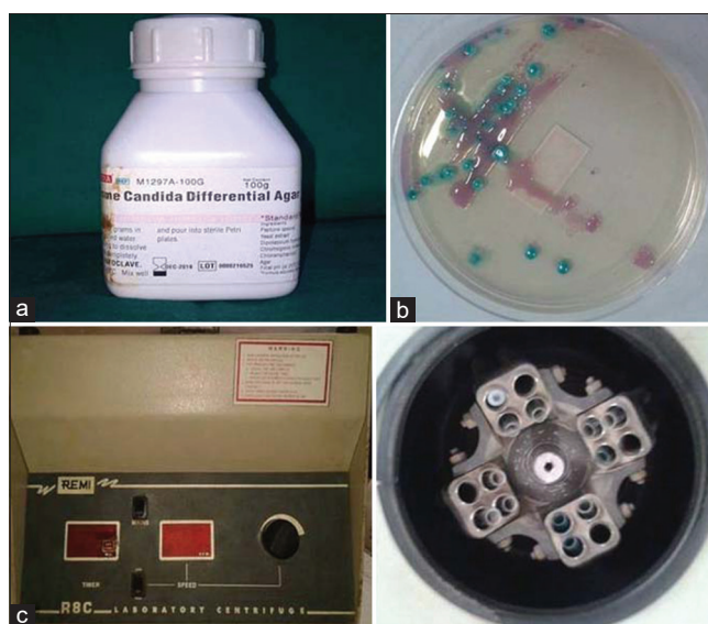
Figure 1: (a) HiCrome differential Color Agar Media (b) Isolated Candida Colonies on Petridish (c) Centrifugation machine

Identification cards were inoculated with microorganism suspensions using an integrated vacuum apparatus. A test tube containing the microorganism suspension was placed into a special rack (cassette), and the identification card was placed in the neighboring slot while inserting the transfer tube into the corresponding suspension tube. The filled