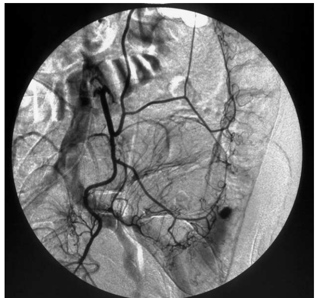
FIGURE 2. Transcatheter arterial embolization of colonic diverticular bleeding.

be required. 32 In 13.8% of the cases, an urgent colectomy becomes necessary, but is burdened by high mortality and morbidity rates (20%). 18 In all the analyzed studies, urgent colonoscopy was performed to achieve the diagnosis of