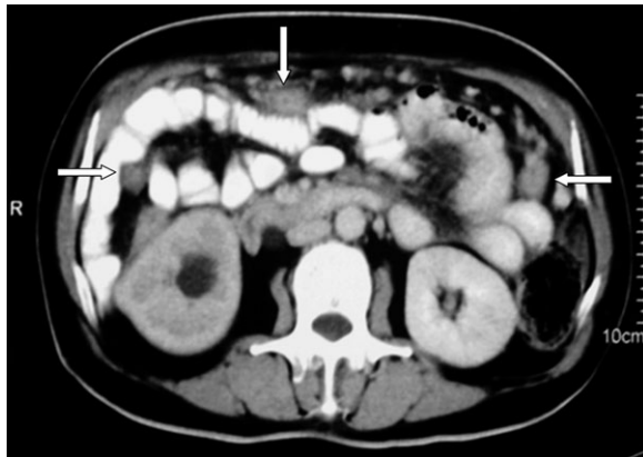
Figure 2 Peritoneal implants in the omentum and small bowel mesentery (arrowheads). Note the right hydronephrosis.

heterogeneously enhancing, lobulated abdominopelvic mass, 21 \times 16 \times 13 cm in size, in relation to the greater omentum which showed subtle, small hypodense areas of necrosis. Ill-defined margins with invasion of the small bowel loops and mesentery, sigmoid mesocolon and vaginal vault were seen with indentation over the anterior wall of the rectum and the posterior wall of the urinary bladder (Fig. 1). Multiple well-defined heterogeneous masses suggestive of peritoneal implants were present in the small bowel mesentery, greater omentum and peritoneum, indenting the posterior surface of the liver adjacent to segment VI (Fig. 2). The distal right ureter was encased by the mass leading to subsequent right hydronephrosis. The liver showed multiple, heterogeneously enhancing masses suggestive of metastasis. Mild ascites was present. As the tumour was very large at the time of imaging, its site of origin could not be ascertained, hence a diagnosis of a sarcomatous tumour arising from the pelvis or solid primary omental tumour,