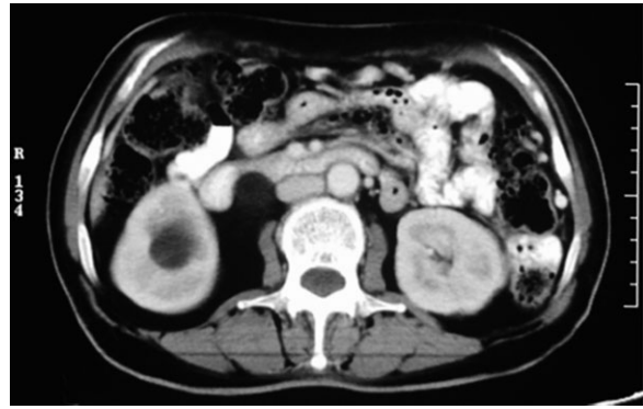
Figure 3 Post-chemotherapy repeat contrast-enhanced computed tomography shows significant resolution of the peritoneal implants.

heterogeneously enhancing, lobulated abdominopelvic mass, 21 \times 16 \times 13 cm in size, in relation to the greater omentum which showed subtle, small hypodense areas of necrosis. Ill-defined margins with invasion of the small bowel loops and mesentery, sigmoid mesocolon and vaginal vault were seen with indentation over the anterior wall of the rectum and the posterior wall of the urinary bladder (Fig. 1). Multiple well-defined heterogeneous masses suggestive of peritoneal implants were present in the small bowel mesentery, greater omentum and peritoneum, indenting the posterior surface of the liver adjacent to segment VI (Fig. 2). The distal right ureter was encased by the mass leading to subsequent right hydronephrosis. The liver showed multiple, heterogeneously enhancing masses suggestive of metastasis. Mild ascites was present. As the tumour was very large at the time of imaging, its site of origin could not be ascertained, hence a diagnosis of a sarcomatous tumour arising from the pelvis or solid primary omental tumour,