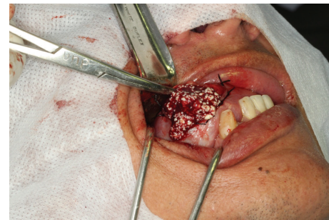
FIGURE 3: Aspect of contents of lesion during surgical excision: material white, friable, and compatible with orthokeratin.

EC have different diagnosis such as infectious lesions of the salivary glands, ranula, dermoid cyst, lipoma, lingual thyroid, and thyroglossal duct cyst [3, 4, 12, 14–16]. In the present case the hypothesis of diagnosis was ranula, dermoid cyst, and EC (Figure 1). The patient reported swallowing and breathing difficulty, probably occasioned for posterior expansion of the lesion in submandibular space.