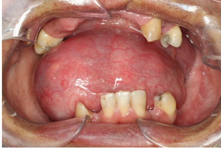
FIGURE 1: Clinical aspect of mass in floor of the mouth, asymptomatic. The patient related difficulty breathing and swallowing.

overlying mucosa. The clinical diagnosis was ranula, dermoid cyst, or epidermoid cyst.