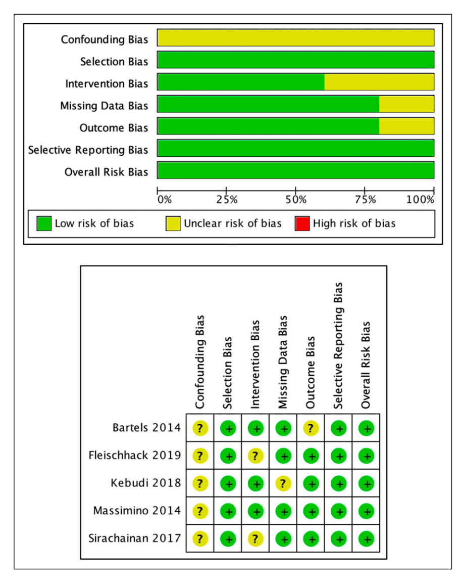
Figure 2. Result of ROBINS-I assessment. A, Risk assessment of bias using ROBINS-I for non-randomized studies in each study. B, the proportion of bias risk assessment results using ROBINS-I for the non-randomized study.

nimotuzumab. No serious adverse events were recorded in Sirachainan's study.