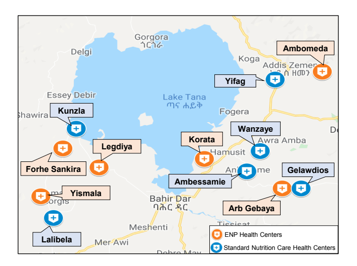
Figure 3 Enhancing Nutrition and Antenatal Infection Treatment study site map, Amhara region, Ethiopia. ENP, enhanced nutrition package.