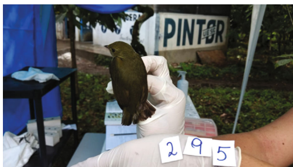
FIGURE 2: Exemplary of the Ceratopipra rubrocapilla species positive for Salmonella Agona.

*One sample was positive for Salmonella enterica subsp. enterica serotype Agona.