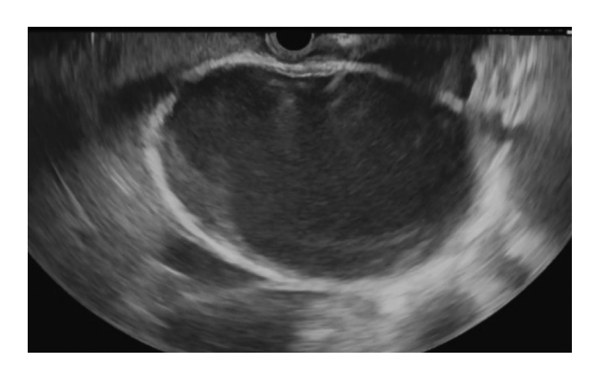
Figure 3. EUS view showing distended gallbladder with intact wall.