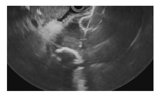
Figure 4. EUS view showing deployment of the distal flange of the lumen-apposing metal stent inside the gallbladder.

the patient was discharged in good clinical condition on postprocedural day 1.