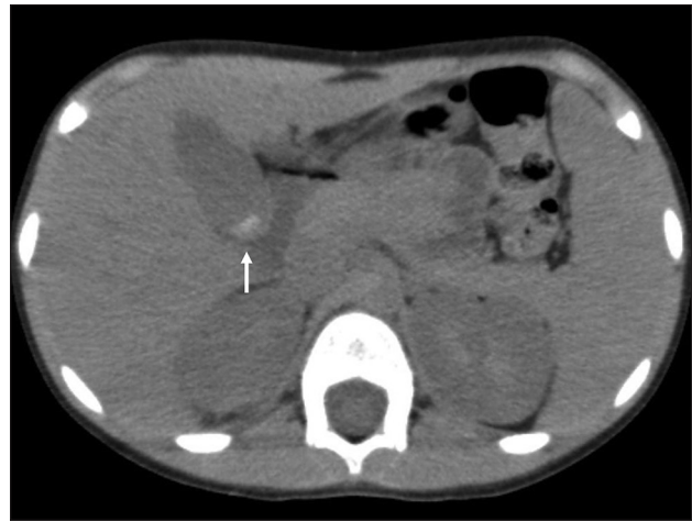
Figure 2: Axial noncontrast-enhanced computed tomography image showing gallstones within the gallbladder (arrow), with no signs of inflammation