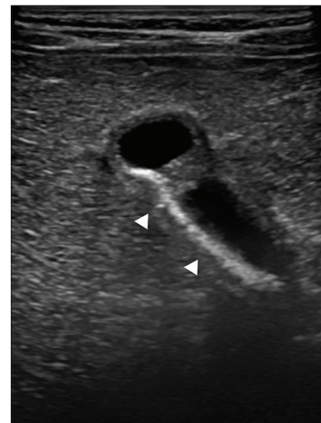
Figure 4: Ultrasound revealed a residual amount of biliary sludge (arrowheads), considerably reduced when compared to previous examination

culture and sensitivity report. A significant clinical improvement was noticed after changing the antibiotic treatment, and the patient's symptoms resolved after 3 days of conservative treatments. One week later, the patient underwent ultrasound reevaluation, which revealed resolution of local inflammatory features and almost complete disappearance of biliary sludge and gallstones [Figure 4].