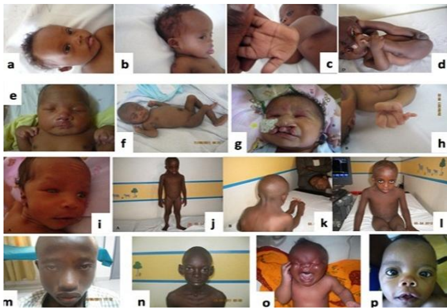
Figure 1 : Patient photos with characterized different syndromes. Patients affected by Down syndrome. (a) hypertelorism, flat nasal bridge, short neck, mongoloid slant; (b) low set ears and protruding tongue; (c) single palmar crease and (d) hyperflexibility; (e) Patient affected by Edwards syndrome, note the presence of hypertelorism, flat nasal bridge, short neck, clenched hands with overlapping fingers; (f) umbilical hernia and club feet; (g) Patient affected by Patau syndrome with typical facial dysmorphism characterized by hypertelorism, cleft lip and palate; (h) and polydactyly; (i) Patient with Cat eye syndrome showing right preauricular tag, right microphthalmia and coloboma; (j) Patient affected by DiGeorge syndrome. Note the presence of long face, hypertelorism, proeminent nose with squared nasal root; (n) Patient affected by Williams-Beuren syndrome presenting periorbital fullness (puffiness around the eyes), long philtrum, wide mouth, large and protruding ears; (o) Patient affected by Noonan syndrome with physical facial signs showing hypertelorism, long philtrum and proeminent upper lip