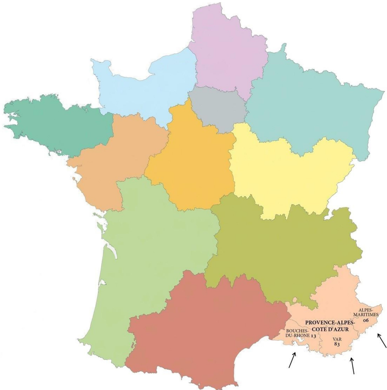
Fig 1. Three sub-regions in South-Eastern France involved in the study. Figure free of copyright reprinted from https://www.pacha-cartographe.fr/fonds-de-carte/ . Figure is similar but not identical to the original image and is therefore for illustrative purposes only.

https://doi.org/10.1371/journal.pone.0236241.g001