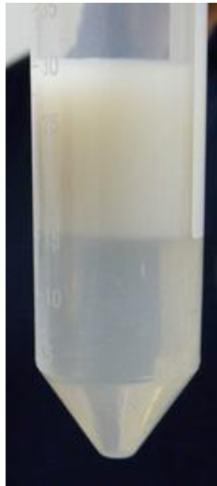
Figure 1. Single-layer centrifugation of stallion semen using Androcoll-E.

Note: the 50-mL centrifuge tube contains 15 mL of extended stallion semen (at a sperm concentration of not more than 100 \times 10^6/\text{mL} ) carefully pipetted on top of the ready-to-use colloid formulation, Androcoll-E.