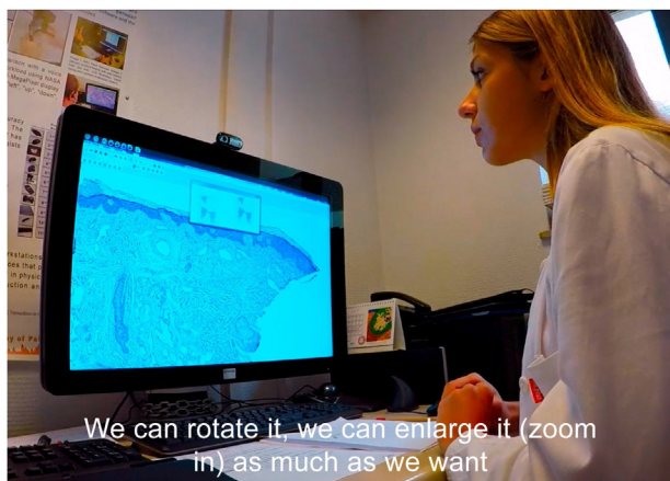
Figure 1 Video tutorial screenshot.

improvement has also been investigated through the study of different gaze patterns. In this sense, both radiologists and pathologists have also used it to assess differences in expertise while reporting cases. 21,22 Finally, gaze is widely used as an interaction tool, improving communication for patients with physical disabilities that limit their movement.