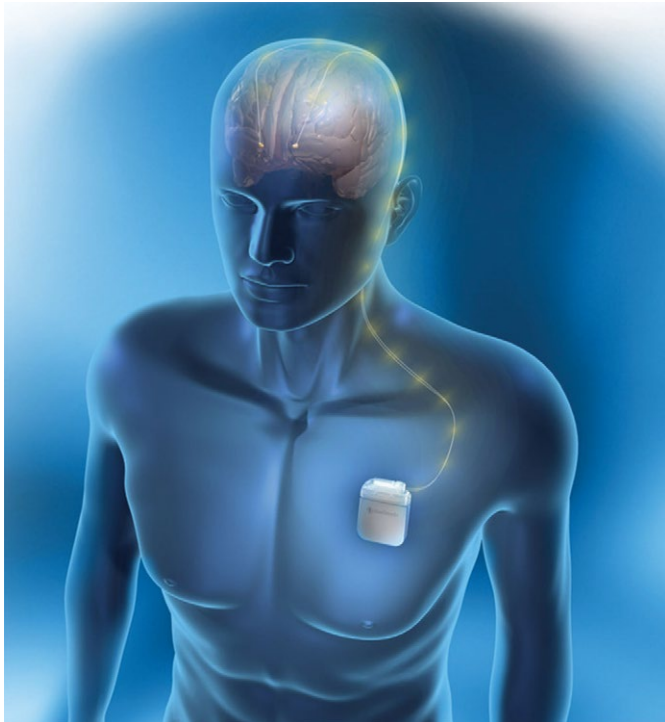
Figure 1: Deep Brain Stimulation Device