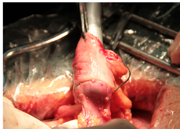
Figure 1 End-to-side anastomosis: withdrawal of circular stapler.

For the FEEA maneuver, small holes were made in the walls of the ileum and the colon using an electric scalpel. The prongs of the linear stapler (Proximate, TLC75 or TLC10; Ethicon Endo-Surgery, Cincinnati, Ohio) were inserted in these holes and were fired to perform the anastomosis (Figure 3). We waited for 30 s before releasing the stapler to allow for hemostasis. The mucosal