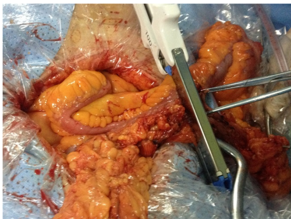
Figure 4 Functional end-to-end anastomosis: resection of ileocecal site using stapler.

Data presented as mean ± standard deviation or n (%). TNM, 'tumor, node, metastases'.