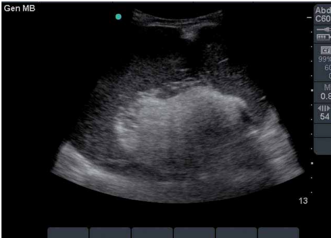
Figure 2: Sonogram of the cyst in situ.