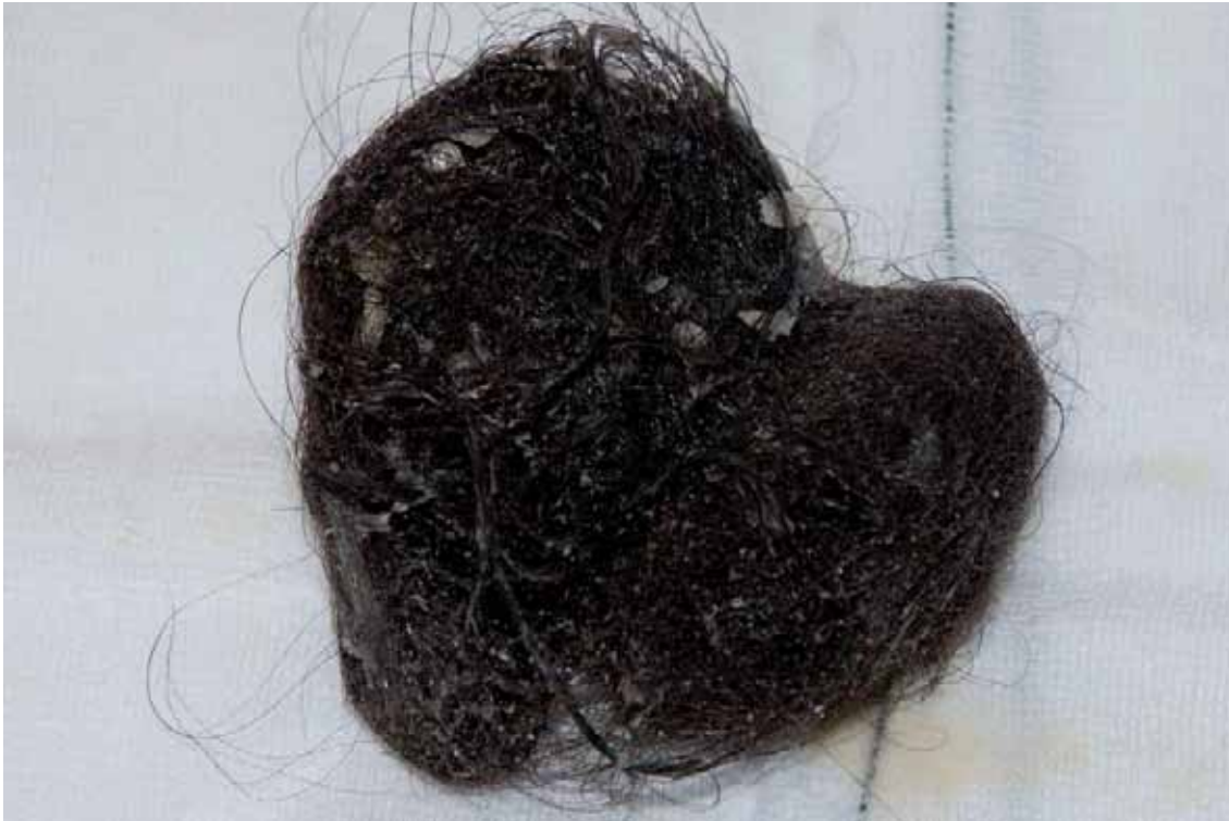
Figure 4: Matted hair found in the cyst.