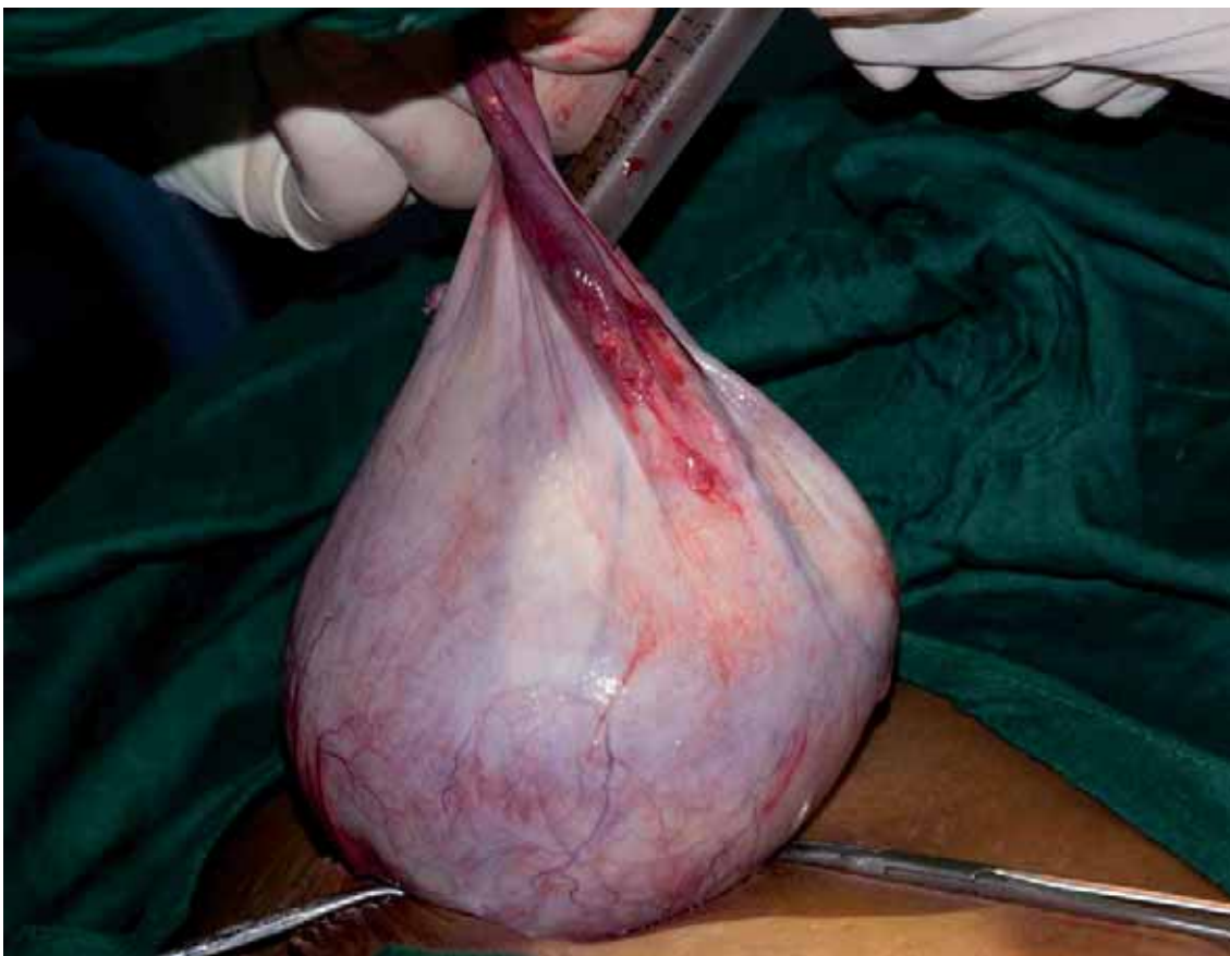
Figure 5: Complete removal of the cyst via oophorectomy.

was clinically palpated which prompted further investigation with ultrasound.