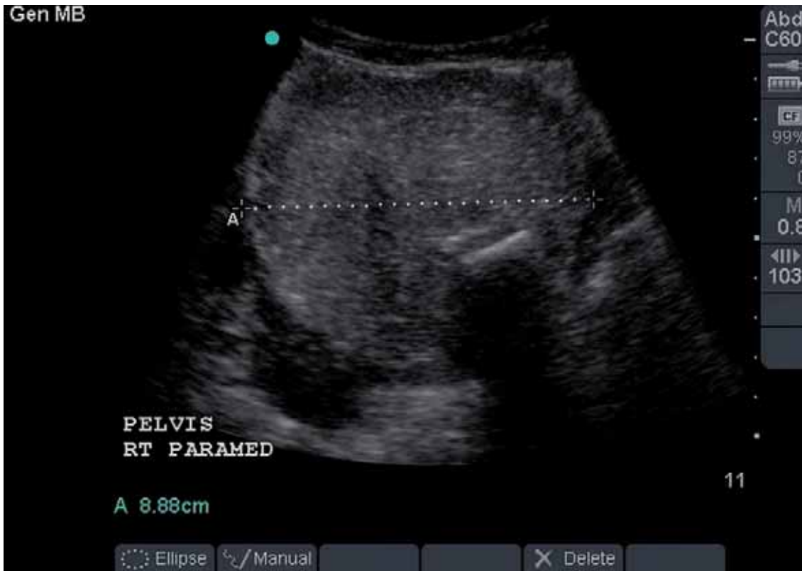
Figure 6: Sonogram of a cystic teratoma in situ.

The echogenic focus with posterior cystectomy shadowing was shown to be a cluster of teeth at surgery.