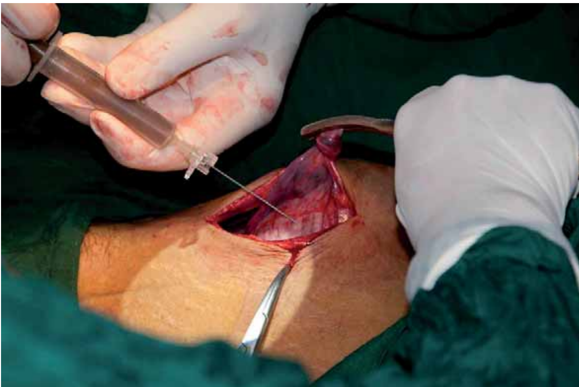
Figure 3: Aspiration and drainage of the cyst before removal at laparotomy.

features favoring a cystic teratoma. The scan demonstrated a large well defined 13 cm echogenic cyst likely containing sebaceous fluid. A large focal region of diffuse echogenicity with posterior shadowing was noted, presumed to represent a ball of matted hair within the cyst. Peripheral hair clusters were seen as scattered echogenic strands and dots. The contents described on