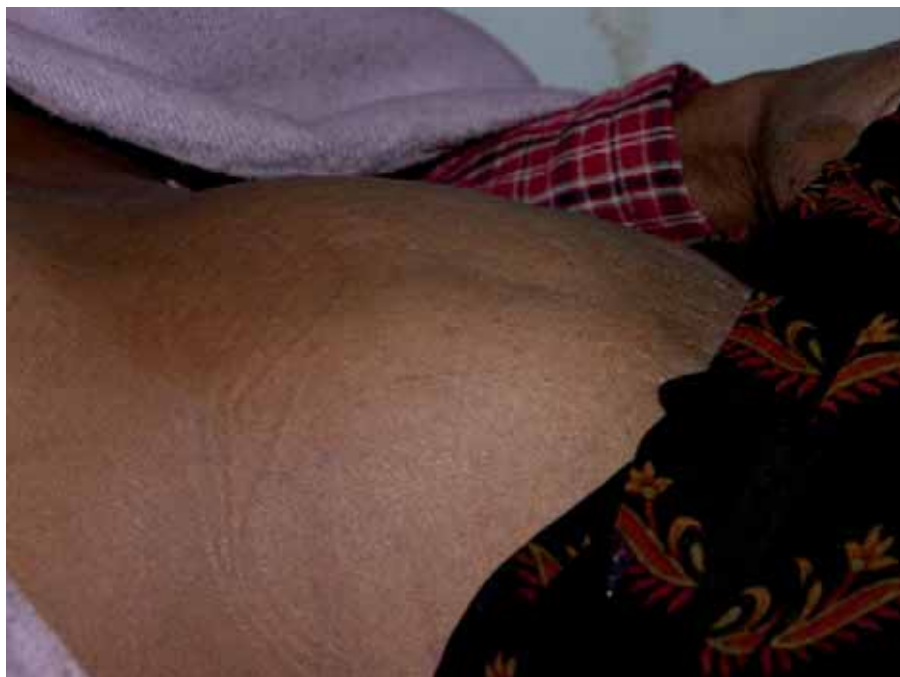
Figure 1: Obvious abdominal swelling pre surgery.

Correspondence to email alan@ alanwilliamsportfolio.com