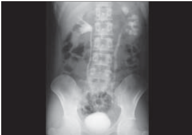
Figure 1: Intravenous urogram showing diseased left kidney and hydroureteronephrosis till the end of mid-ureter

The investigative workup must be able to define the morbid anatomy/functional status of entire urinary tract using uroimaging modalities like intravenous urogram [Figures 1 and 2] or retrograde or antegrade ureteropyelogram/magnetic resonance urography in case of poor renal function. Cystography is needed to have an idea about bladder capacity and vesicoureteric reflux [Figure 3]. Computed tomography (CT) urography is now considered the imaging modality of choice for diagnosis and evaluation of GUTB. [3] Three-dimensional image reconstruction is possible and abdominal imaging may be of additional value for defining extent of coassociated retroperitoneal or mesenteric fibrosis and bowel disease. Similarly ultrasonography can be used to monitor the size of kidney during chemotherapy or to monitor the volume of contracted bladder during treatment. The actual quantification of renal functional status of both