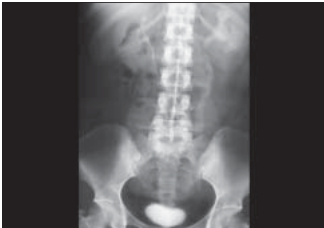
Figure 2: Intravenous urogram showing diseased left kidney with hydroureteronephrosis because of stricture of lower ureter. The bladder is of small capacity

kidneys by radionuclide scan is of key value in planning definitive treatment and prognosticating the outcome and hence should preferably be done in most cases, especially if the kidney is nonvisualized on intravenous urography (IVU). Another issue that needs to be addressed is to find out as to whether the stricture disease represents old/healed fibrosis or quiescent disease or there is some degree of ongoing active inflammation. One may use nonspecific predictors such as total/differential leukocyte counts, erythrocyte sedimentation rate, antituberculous antibody titers, but more valuable are demonstration of microscopic hematuria with or without pyuria and a positive Bactec test or Versatrek test in urine. The degree of bladder involvement must be assessed by frequency-volume charting, cystography, or even cystoscopy under anesthesia before proceeding with surgical reconstruction. A shrunken bladder may need to be tackled simultaneously by some kind of augmentation.