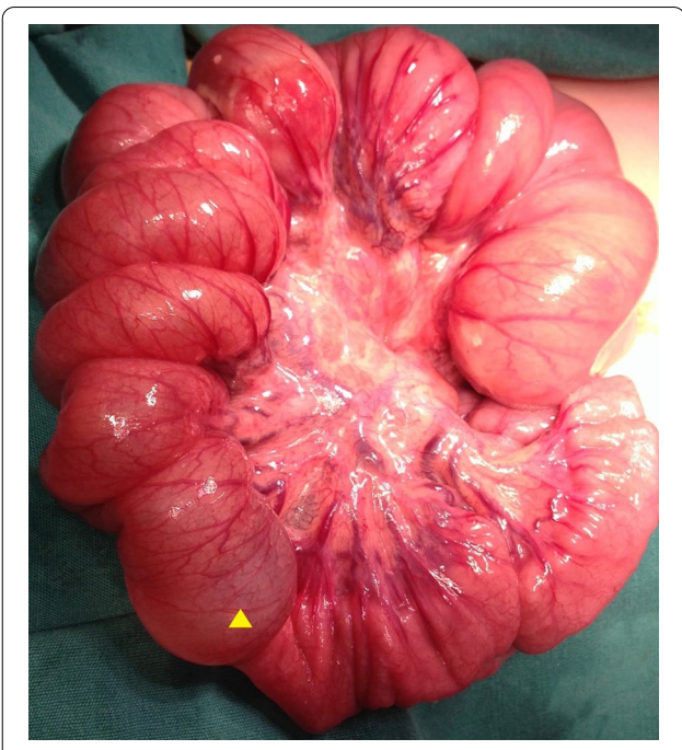
Fig. 4 Operative view of intussusceptions with approximately ten loops. Sterile water-filled Foley catheter balloon (yellow arrow)