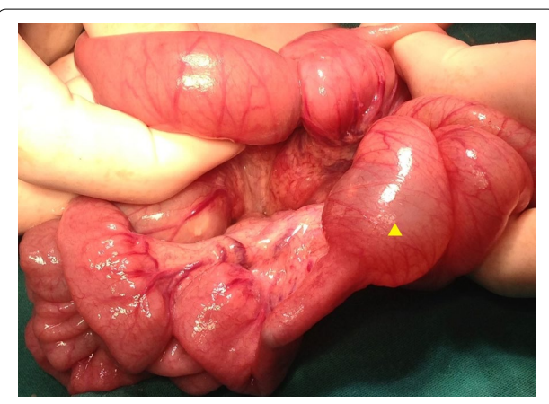
Fig. 5 One of the intussusceptions before reduction. Sterile water-filled Foley catheter balloon (yellow arrow)

catheter had migrated forward from the stomach to the mid-small intestine—a distance nearly 10 times its length. Retrograde intussusceptions involving 70 cm of jejunum were detected, which were formed by approximately 10 separate 5–6 cm intussusceptions starting from the Ligament of Treitz (Fig. 4), and manual reduction was performed (Fig. 5). Careful evaluation of the reduced jejunal segments showed that most of the intussuscepted segments had necrotic areas of up to 1–2 cm, with minute perforation near the mesenteric border (Fig. 6).