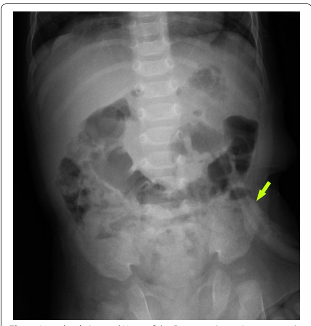
Fig. 1 Upright abdominal X-ray of the Pezzer catheter (green arrow) 4 months after placement

At 5 months of age, the Pezzer tube was dislodged unintentionally at home, and a 12-French silicon Foley catheter was inserted at a local hospital. At 5 months and 3 weeks of age, the patient was admitted again to our hospital with respiratory complaints, nonbilious