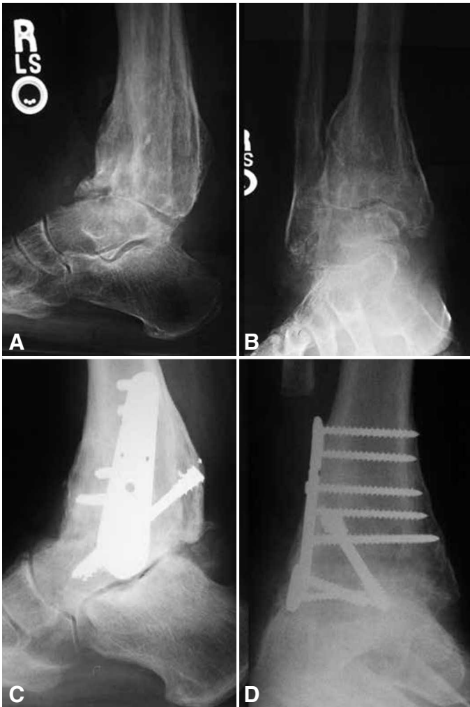
Figure 3 - 61 year old male patient presented with post-traumatic tibiotalar arthritis with pain and deformity. (A) The preoperative radiographs considerable deformity including anterior translation of the talus relative to the tibia and (B) varus deformity in the coronal plane. (C) Lateral and (D) AP weightbearing radiographs taken at 18 months follow up after corrective arthrodesis and successful fusion.

In conclusion, we believe that a combination of bilateral compression, contoured bony cuts, and lateral locked plating offers a novel, accurate, and useful technique for performing ankle arthrodesis.