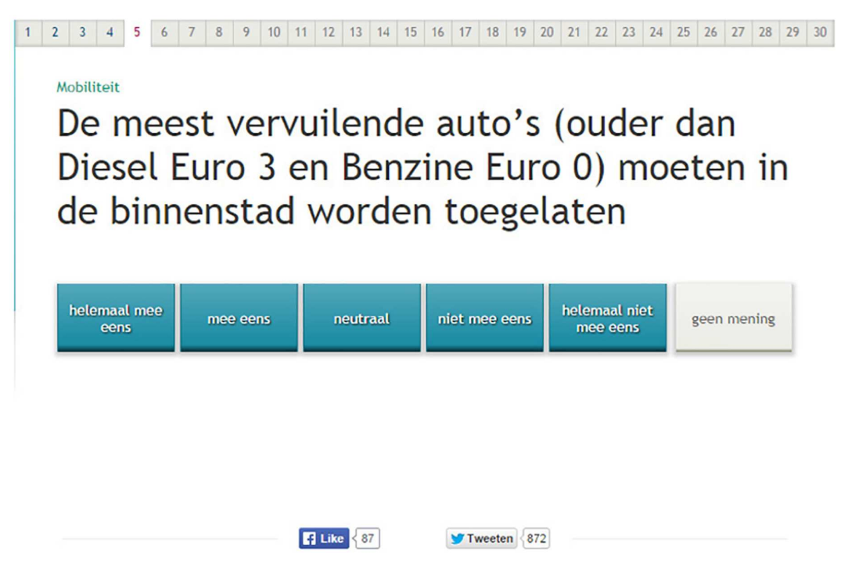
Fig 1. Example of a positive question version as presented on screen. Legend: The question reads "The most polluting cars (older than Diesel Euro 3 and Gas Euro 0) should be allowed in the city centre."