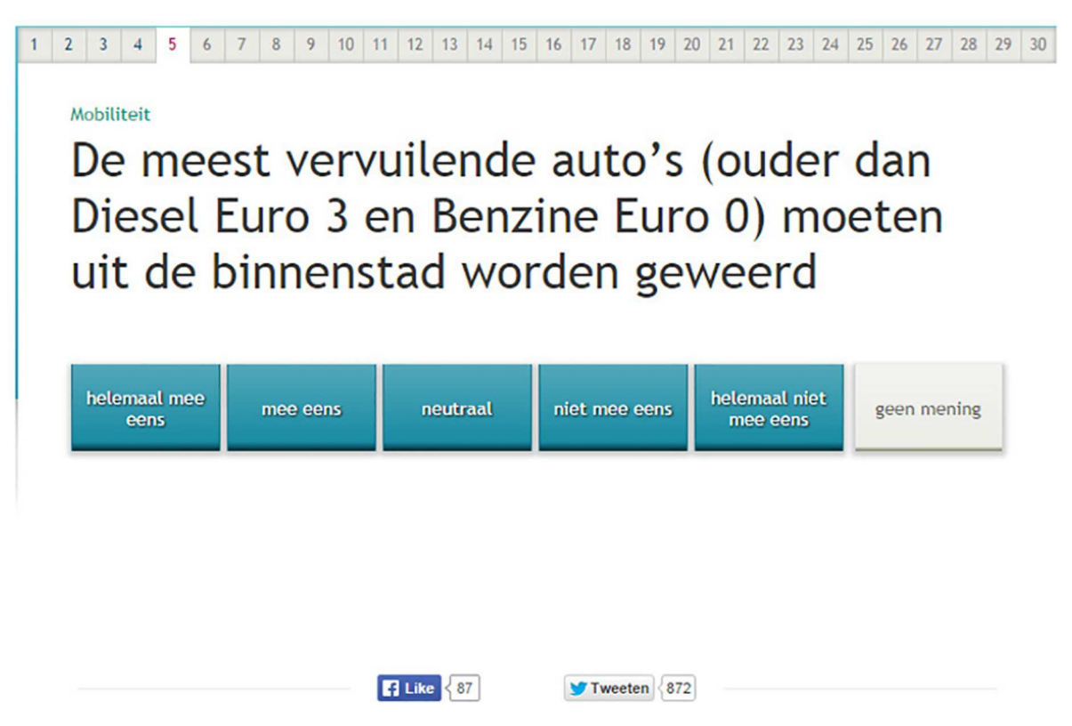
Fig 2. Example of a negative question version as presented on screen. Legend: The question reads "The most polluting cars (older than Diesel Euro 3 and Gas Euro 0) should be banned from the city centre."