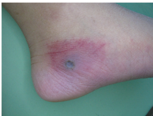
Figure 1. Classical single lesion with indurated erythematous papule and central necrosis.