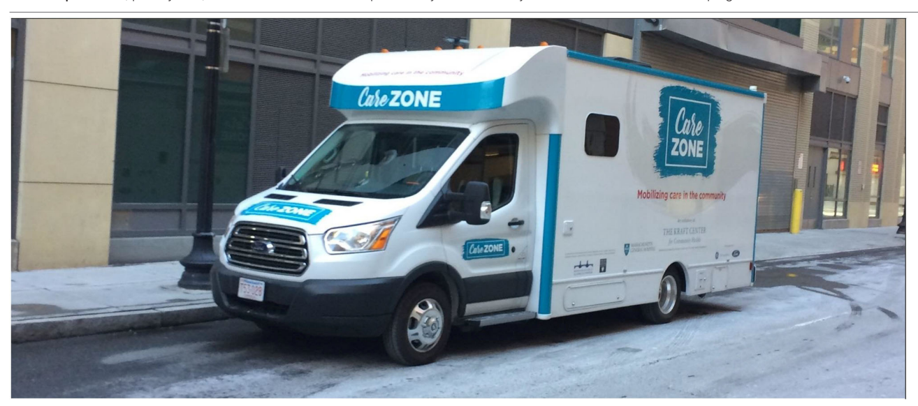
TABLE 1 | Addiction, primary care, and harm reduction services provided by the Community Care in Reach mobile addiction program.