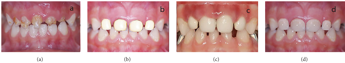
FIGURE 2: Type of treatment acceptable for deep anterior caries. (a) No treatment, (b) open (resin) faced stainless steel crown, (c) strip crown, and (d) zirconia crown.