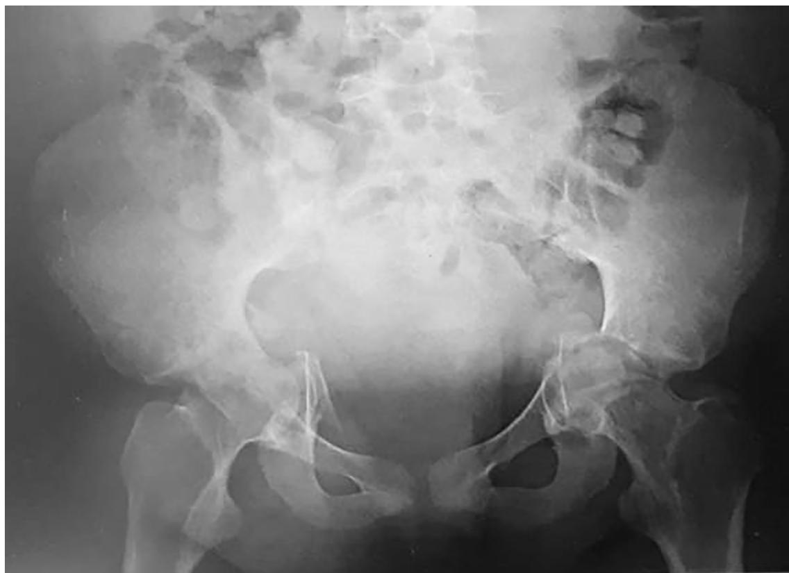
Fig. 1. The first X-ray show bilateral multifragmentary fracture of the acetabulum and protrusion of the femoral heads in the pelvis.

expresses the same phenotypic traits as her mother, who suffers from autosomal dominant OI. Following a fall from a chair during an epileptic seizure, the young patient came to our observation. Medical history did not predict any other fractures. She was not taking bisphosphonates before the injury but she was taking valproic acid for epilepsy.