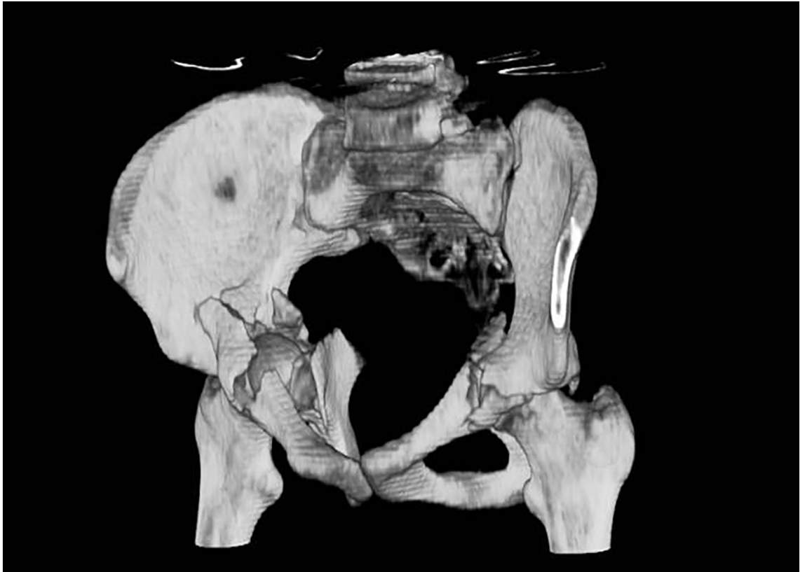
Fig. 2. The three dimensional reconstructed computed tomography gave us further details for planning the operation through intrapelvic and exopelvic vision.

Numeric Pain Rating Scale (NPRS), a segmented numeric version of the visual analog scale (VAS), used to assess pain intensity, reported a score of 5/10 (moderate pain) at the final follow-up. The last radiographic examination showed an adequate reduction of the fracture and a satisfactory wall and bone stock for a subsequent prosthesis: the patient developed a bilateral post-traumatic arthrosis with heterotopic calcifications typical of the underlying disease.