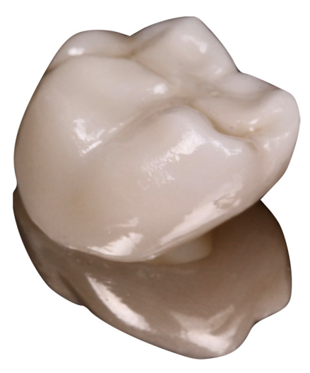
Figure 3. Finished MZC.

Through the Wieland milled machine (Zenotec select hybrid; Wieland Dental, Pforzheim, Germany), all monolithic zirconia crowns (MZCs) were made from partially sintered supertranslucent multilayered zirconia blanks (KATANA Zirconia STMAL; Kuraray Noritake, Miyoshi, Japan). This material combines a high degree of transparency with a good flexural strength (600–800 MPa). All restorations were sintered at 1.550 °C for 2 h in a furnace (Programat CS4; Ivoclar Vivadent). The sintered restorations were characterized and glazed with Cerabien ZR (Kuraray Noritake) at 750 °C for 10 min, following the manufacturer's specifications in all producing steps (Figure 3). All crowns were prepared by an experienced technician.