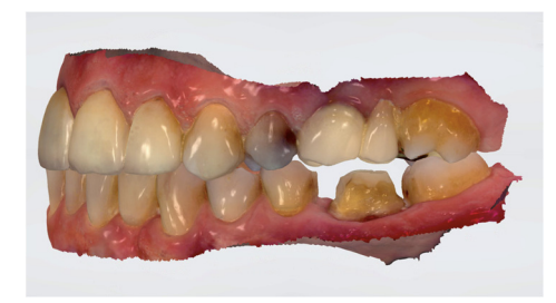
Figure 2. Digital impression.

All restoration designs were carried out using the 3Shape software (3Shape) according to the properties of the material, anatomical limitations, and aesthetic expectations.