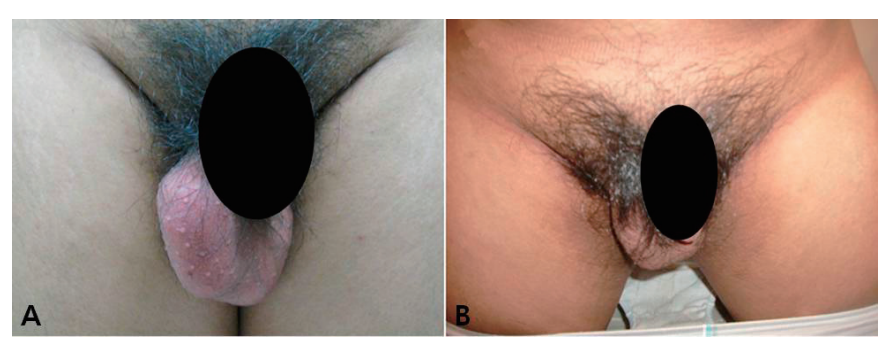
Fig. 1. Testicular examination before and after dexamethasone treatment. (A) Before treatment. Both testes were enlarged, with the right testis measuring 10 \times 6 cm and the left testis measuring 7.5 \times 4.5 cm. (B) After 3 weeks of dexamethasone therapy, the volume of each testis was 25 mL.

treatment is ineffective, however, surgical intervention should be considered. We describe here a patient with untreated CAH who presented with huge TARTs, which regressed with dexamethasone therapy.