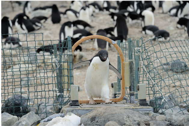
Figure 2. Adélie penguins are identified and weighed each time they cross the automated weighbridge on their way to/from the sea. doi:10.1371/journal.pone.0085291.g002

that we obtained, these results will need to be confirmed by further studies.