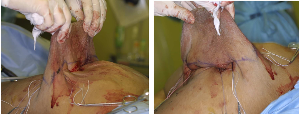
Figure 2: Operative view for Patient 6. The skin near the base of the tumor to be resected was ligated by inserting silk thread.

pachydermatocele. Ligation of the skin around the tumor is expected to temporarily reduce the blood flow to the tumor from the skin. Maeda et al. [10] reported a similar method of ligation around the tumor using a Tsukisui device during neurofibroma resection. Ligation using a Tsukisui device is simple and can be used as a substitute for the skin ligation around the tumor following our method. Our method of conducting hemostasis with the ABC at the time of resection is considered to be a more effective countermeasure for bleeding.