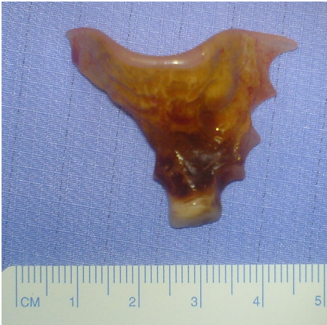
Figure 1 Dental plate removed from oesophagus via transthoracic oesophagotomy.

location in the thoracic oesophagus, it was elected to approach the foreign body via a right posterolateral thoracotomy through the fourth intercostal space. At operation, the mid-oesophagus appeared thickened, and there was marked peri-oesophageal inflammation and fibrosis. There was no evidence of perforation or fistula within the right pleural cavity. After dividing the azygos vein, the dental plate was removed via a longitudinal oesophagotomy (Figure 4), which was closed in two layers with an absorbable 2/0 suture. He made an uneventful postoperative recovery. A postoperative water-soluble contrast study was normal, and he was discharged on day 8. At follow up, his swallowing had returned to normal, but he had a persistent hoarse voice due to recurrent laryngeal nerve palsy, for which he has been referred for injection laryngoplasty.