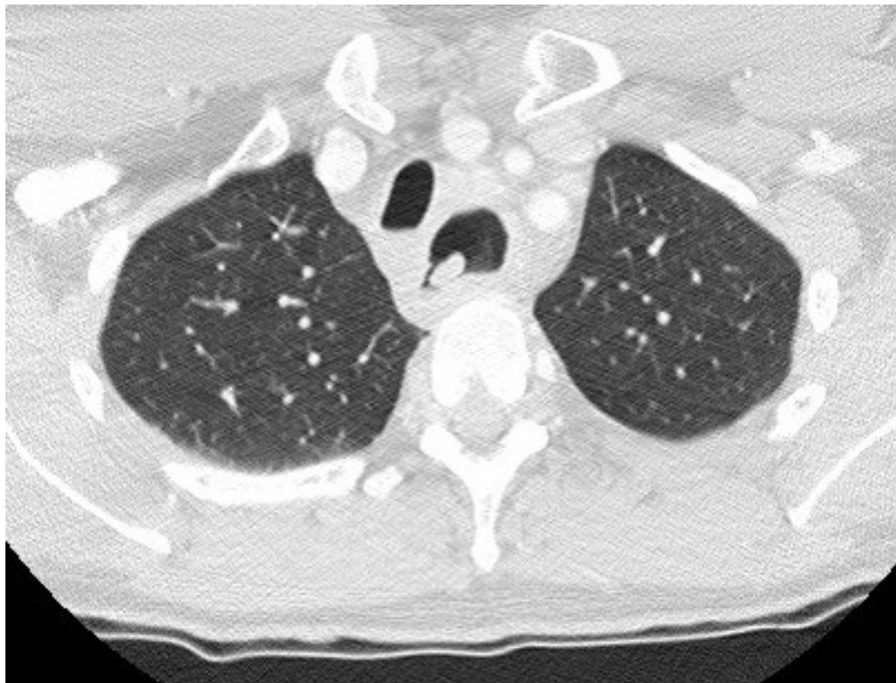
Figure 2 Oesophageal thickening and intraluminal mass seen on computed tomography (lung windows).

Prompt diagnosis and retrieval of impacted foreign bodies in the oesophagus is essential to avoid potentially fatal complications such as perforation and fistulation into surrounding structures such as the tracheobronchial tree or aorta [1-4]. This case illustrates the difficulties of confirming the presence of a retained oesophageal foreign body despite a strong clinical suspicion and the increased symp-