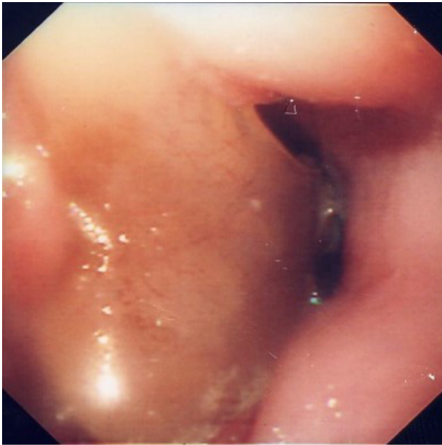
Figure 3 Dental plate impacted in oesophagus at endoscopy.

tomatic and surgical morbidity that resulted from such a delayed diagnosis.