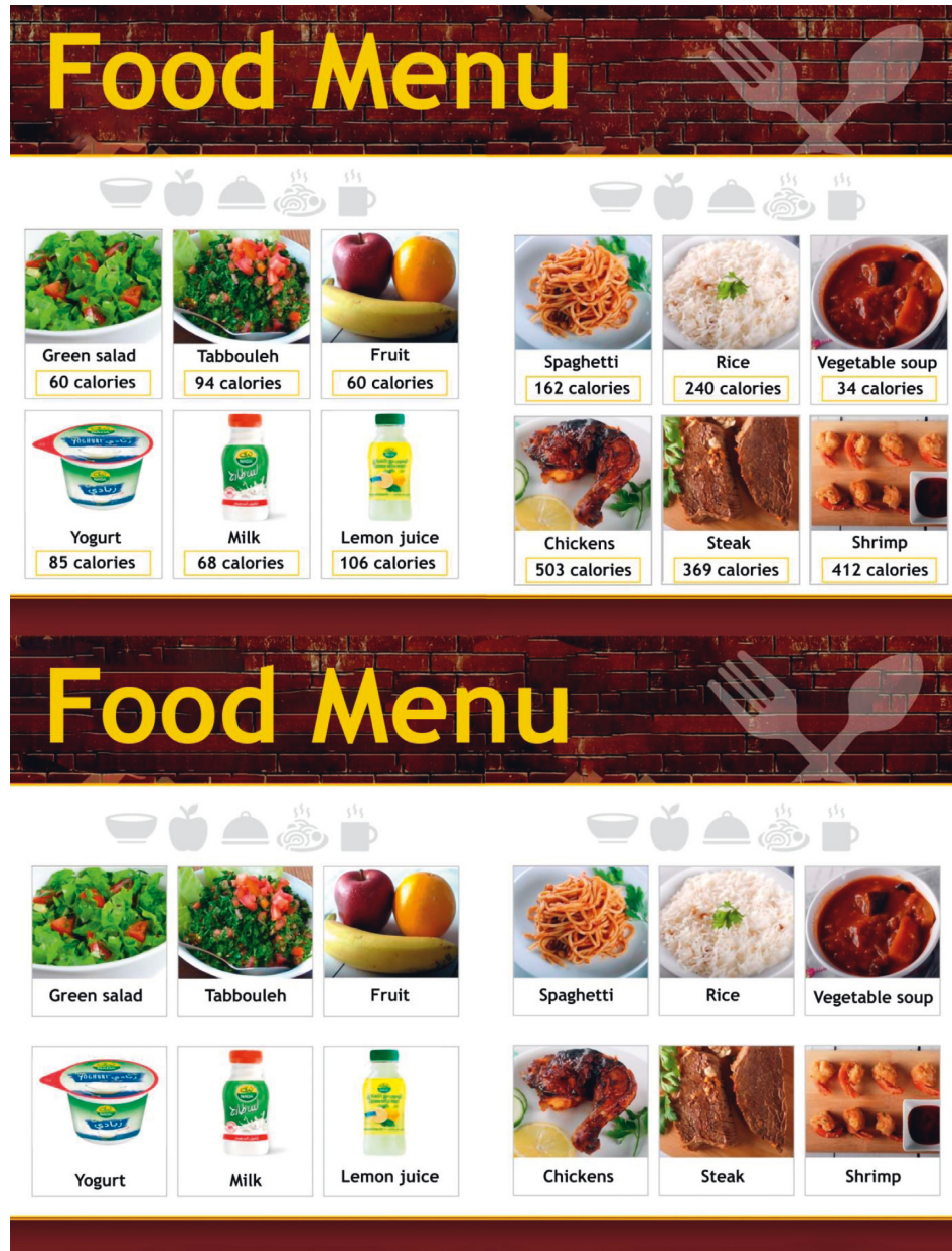
FIGURE 2: Menus without and with calorie information.

The majority of the participants in the control group had accurate body weight perception (61.1%), and 42.1% of the participants in the experimental group had a significant difference in body weight perception ( P < 0.001 ). The mean weight concern in the experimental group was higher than that in the control group, with a significant difference between the groups and the three statements. Meanwhile, 32.3% of the experimental group and 25% of the control group used unhealthy weight-control behaviors to lose weight or to prevent weight gain; however, there was no statistically significant difference between these percentages. More than half of the participants in the control and experimental groups (59.5% and 52.5%, respectively) had been fasting for long hours, an unhealthy behavior, and 25% of the participants in the experimental group vomited. The