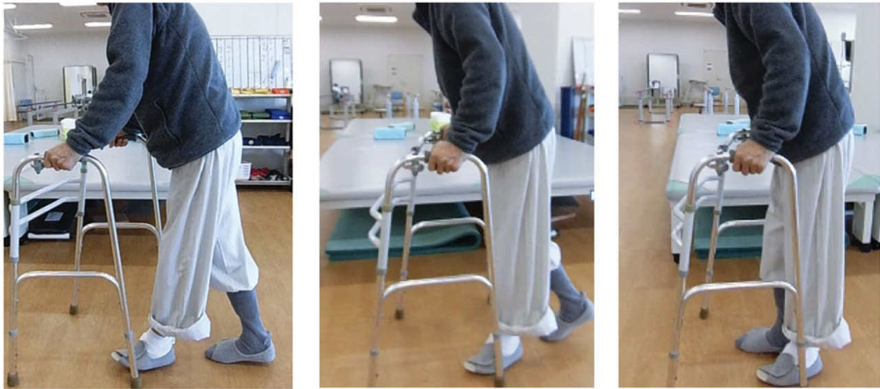
Figure 3. Treatment outcome at one post-operative months. The Barthel Index improved from a score of 45 to 80, and the patient started to walk using a four-point walker.

and additional surgical management was unnecessary. After rehabilitation exercise, as of one post-operative months, he became able to stand with assistance when moving from a wheelchair, walk using a four-point walker, and his Barthel Index improved to a score of 80 (Figure 3(b)).