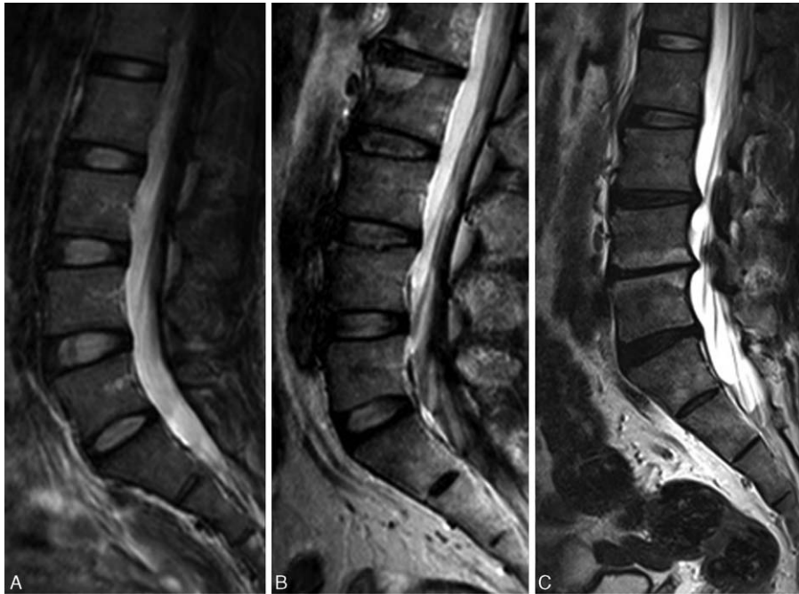
FIGURE 1. Sagittal T2-weighted magnetic resonance images showing a subject with (A) no modic changes (MCs), disc degeneration or history of prolonged severe low back pain (LBP); (B) another subject with MCs at L1 to L2 affecting anterior zone in cranial vertebral body, and anterior and midpoint zone in caudal vertebral body adjacent to the endplate, and history with disc degeneration, but no prolonged severe LBP; and (C) another subject with MCs at L4 to L5 affecting the whole anterior-posterior length in both cranial and caudal vertebral bodies adjacent to the endplates with disc degeneration and history of prolonged severe LBP.