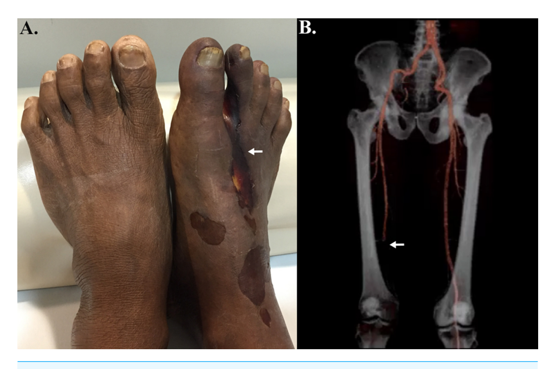
Figure 2 Clinical features of vascular pythiosis. (A) Gangrenous ulcer of the right foot (arrow); (B) Peripheral run-off computerized tomography angiography shows total occlusion of the right proximal-todistal popliteal artery (arrow). Full-size DOI: 10.7717/peerj.8555/fig-2

infection usually ascends to a proximal arterial issue, which leads to thrombosis, arterial occlusion, and aneurysm (ruptured aneurysm results in mortality). Vascular pythiosis of the upper extremities has been occasionally reported ( Worasilchai et al., 2018; Khunkhet, Rattanakaemakorn & Rajatanavin, 2015 ). There are only a few cases of carotid artery involvement, an extremely rare but potentially fatal condition that results in meningitis, cerebral septic emboli, brain abscesses, and death. Patients with an immunosuppressed or neutropenic condition may present with abrupt-onset infection (i.e., within days after the onset of symptoms), with or without a history of exposure to aquatic habitats ( Chitasombat et al., 2018a; Hoffman, Cornish & Simonsen, 2011; Hilton et al., 2016 ), and develop necrotic skin lesions/cellulitis that progress to vascular infections shortly afterward (within a few days or weeks).