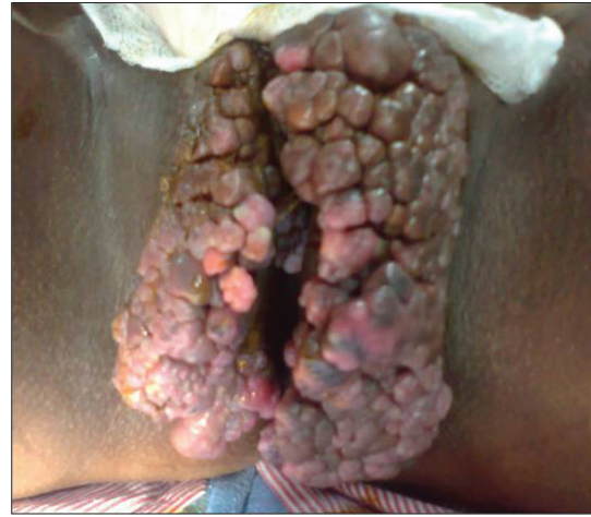
Figure 1: Large polypoidal growth measuring around 10 × 6 cm involving the vulva including bilateral labia majora, clitoris, labia minora, and anterior fourchette

Vulvar lymphangiectasia can be asymptomatic, pruritic, burning, or painful. It is an unpleasant but benign condition. [6] Our patient was asymptomatic. Clinically, lymphangiectasia is characterized by thin-walled translucent vesicles filled with clear