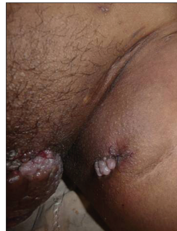
Figure 2: A few grouped papules of similar morphology over the left upper thigh