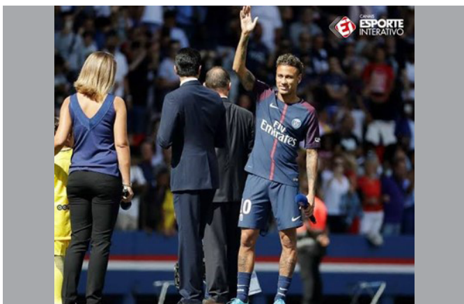
Figure 3. Neymar Júnior's debut in PSG.

Although there are not many direct reports on the subject in press sources, 31 one can notice in his performances in matches and training that Neymar Júnior, left-hander of the Brazilian team and one of the main players of world soccer, has a certain degree of bow leg, more noticeable in his left knee (Figure 3).