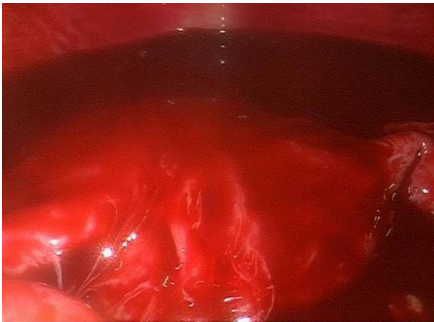
Figure 1: laparoscopy showed a moderate hemoperitoneum