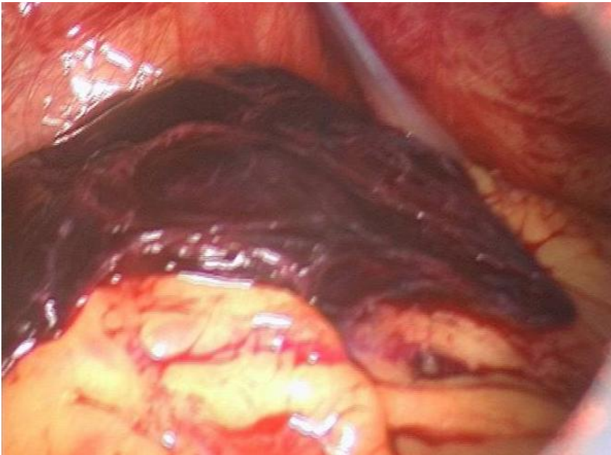
Figure 2: in the surface of omentum was a lesion that seems attributable to blood clot, tenaciously adhered to omental tissue