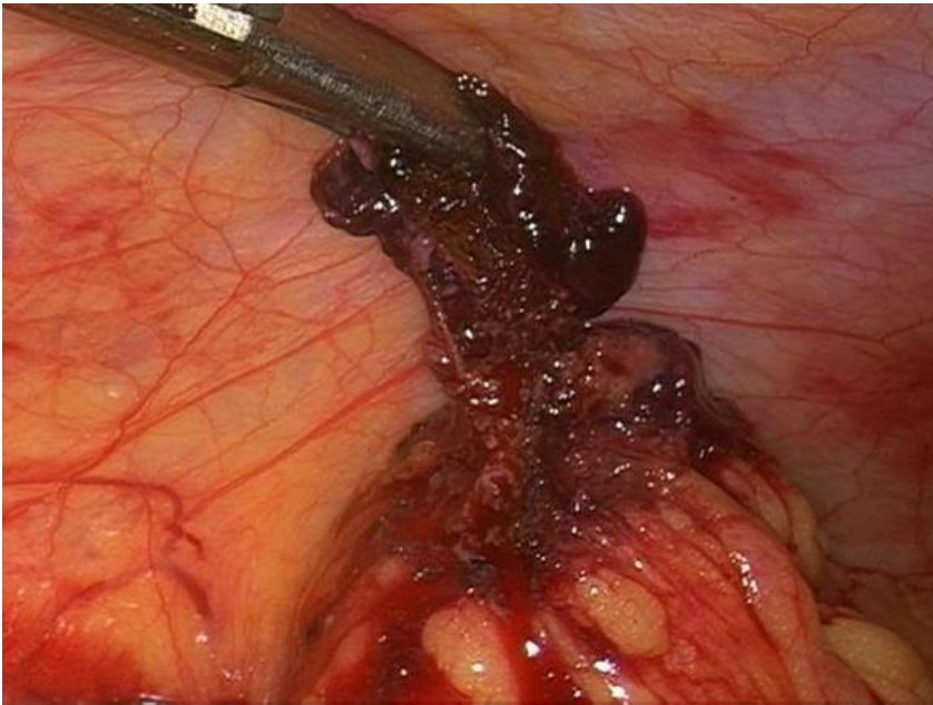
Figure 4: friable mass of about 30 mm removed by forceps and bipolar scissors