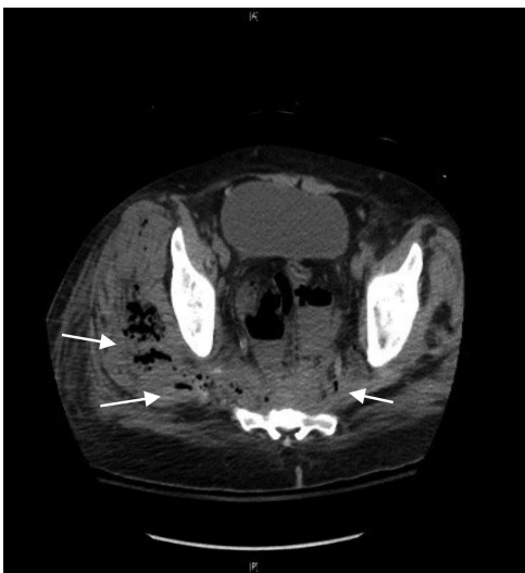
Figure 2: CT axial view showing tract from presacral space through the sciatic notch to thigh muscles.

irrigated via the sigmoidoscope. Once satisfactory drainage was achieved, a Malecot catheter was then inserted through the rectal perforation into the presacral space. A laparoscopic diverting loop ileostomy was then created to allow for healing.