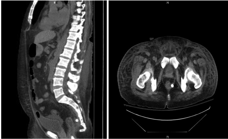
Figure 3: Computed tomography (sagittal and axial views) showing post-operative resolution of the presacral abscess (post-operative day 5).