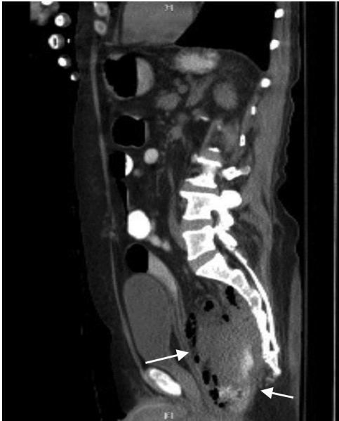
Figure 1: CT sagittal view showing contrast (white) entering the lumen of presacral abscess and rectus abdominis muscle pushed anteriorly.