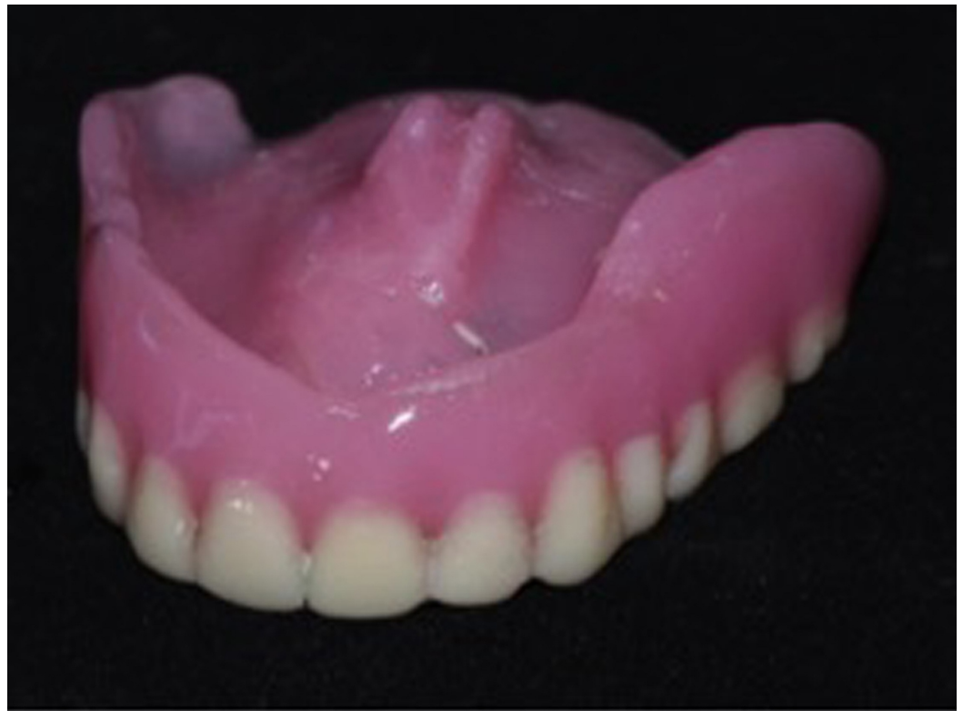
FIGURE 2: Maxillary complete denture showing the coverage of the defect

After discussing the possible treatment options with the patient, considering her age and medical condition, fabrication of a conventional complete denture prosthesis that would restore aesthetics and function, as well as obliteration of the fistula, was planned. A maxillary and mandibular preliminary impression was taken with irreversible hydrocolloid using a stock tray (after packing the defect with gauze to prevent impression material from entering the nasal cavity). An impression was poured with dental stone Type IV and a custom tray was fabricated using auto polymerizing acrylic resin. Border molding was done with green stick compound, and a second impression was made with elastomeric impression material after blocking the defect with gauze. In the master cast, the vestibular and palatal defect was blocked with wax to relieve undercuts before fabrication of the denture base and occlusal rim. Tentative jaw relation was done and transferred to a mean value articulator for artificial teeth arrangement. During the wax try-in appointment, the patient's centric relation, esthetics, and phonetics were assessed. A functional impression was made using the trial denture maintaining the correct vertical dimension at occlusion. It was then processed with heat-cured acrylic denture base material (Figure 2).