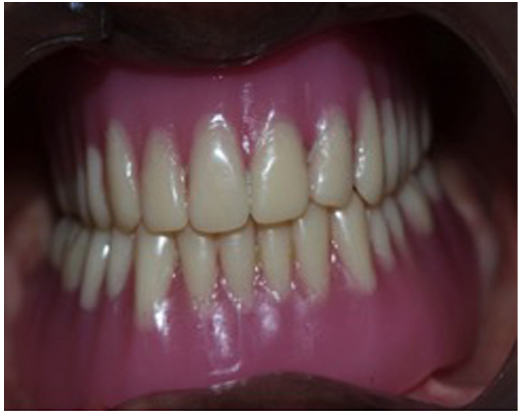
FIGURE 3: Complete denture in occlusion

Post-insertion instructions on proper use, care, and maintenance of the prosthesis were given to the patient. The patient was reviewed after 24 hours and once every two weeks for the next three months (Figure 4).