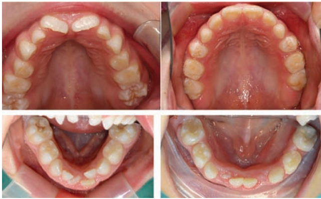
Figure 3. Treating children with baby dentition can help develop the jaws and improve their breathing. Note high palate on the top left (upper jaw before) and top right much flatter (after) forwardontic expansion and postural treatment. In the lower left (lower jaw before) and right (after), note there is much more space for the tongue after 3 months of treatment.

Addressing oral posture is the common thread for each of these studies and a sound reason to direct attention and funding to testing and developing postural approaches (rather than the historical and current attention to functional approaches) for the correction of malocclusion and sleep disordered breathing.