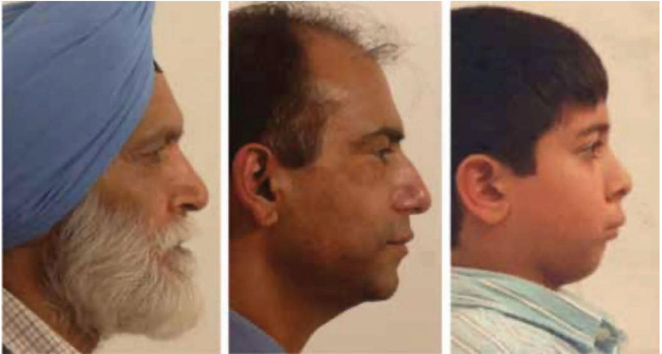
Figure 1. Indian Grandfather born in village who had come to England as a young man with his children. Son in center. Grandchild (right) was born in industrialized society. You can see a progressive reduction in the forward dentofacial growth in the three generations.