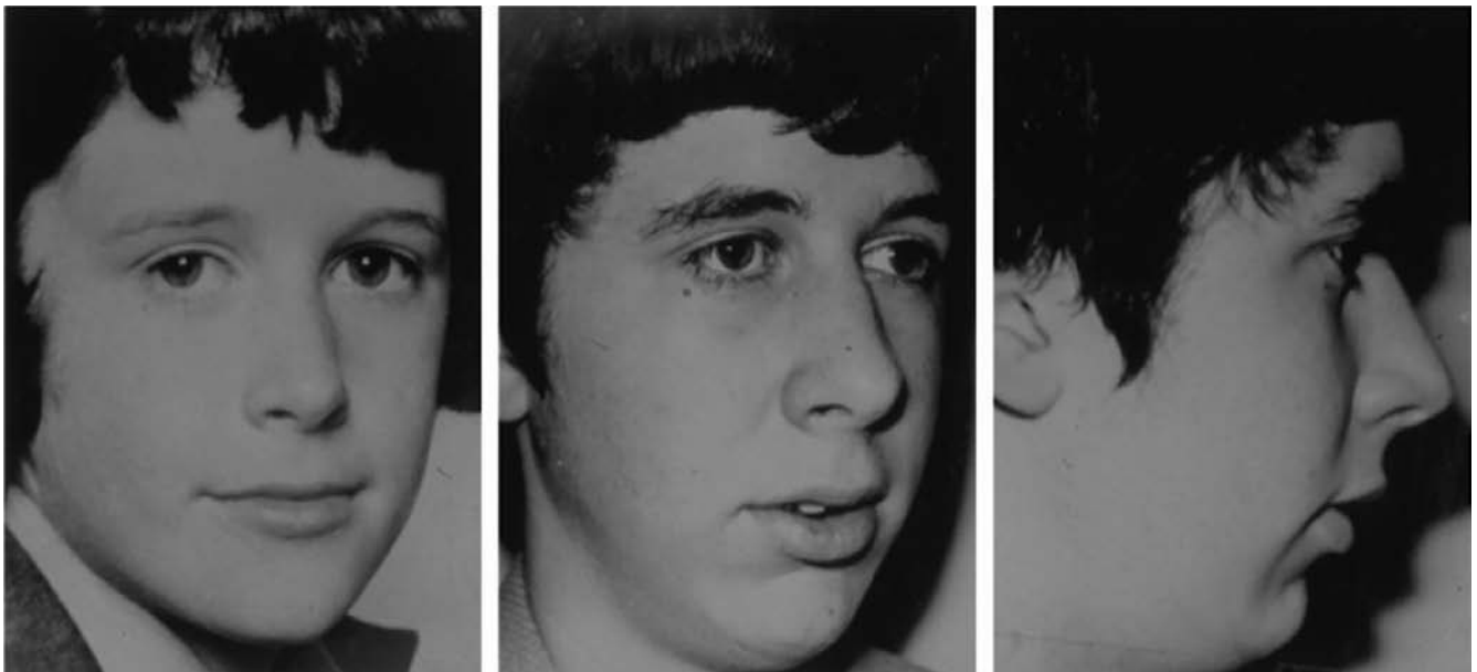
Figure 2. Allergy can block a young person's nostrils as thoroughly as plastic plugs can block those of a rhesus monkey. Look at the consequences in the present figure for an attractive youth (left) getting a gerbil for a pet. He was allergic to the gerbil, and the resulting nasal congestion and mouth breathing redirected the growth of his jaw with sad results (center and right).