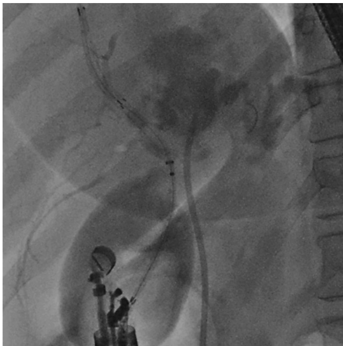
Fig. 1. Combined EUS-BD and endoscopic retrograde cholangiopancreatography in a malignant hilar biliary obstruction, restenting the left hepatic duct and hepaticoduodenostomy on the right hepatic duct, achieving bilateral drainage. EUS: after guidewire introduction, a hybrid metallic stent was placed between the right hepatic duct and the duodenal bulb.