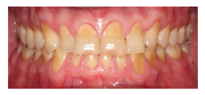
FIGURE 3 Intraoral photographs showing erosion on the cervical and facial aspects of the teeth

patient did not report any significant medical history, except for a dental history of amalgam fillings 15 years ago. The patient brushed his teeth once daily using a medium bristled brush and a horizontal tooth brushing technique. Upon examination of the oral cavity, the upper third molar opposing the site of the pain appeared to be supra-erupted, forming abnormal contact with the soft tissue. Radiographic examination (bitewing radiographs in Figure 1 and panoramic radiographs in Figure 2) confirmed the clinical findings. The supra-erupted upper third molar that formed abnormal contact with the lower gum was determined as the cause of pain in the area. The oral examination also revealed generalized erosion on the facial, cervical (Figure 3), incisal and occlusal (Figure 4) surfaces of the teeth. Heat and cold sensitivity tests revealed normal results indicating that the patient experienced no dentin hypersensitivity. The medical history did not reveal usual suspected causes of erosion.