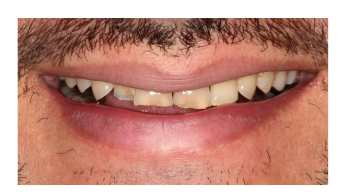
FIGURE 7 Patient's teeth hardly visible upon smiling

of sensitivity and patient's satisfaction with the appearance and function of his teeth did not require any restorative treatment because the teeth were not visible upon smiling (Figure 7). The supra-erupted third molars were extracted (Figure 8A), and the proximal surface of the lower left first molar was restored using composite resin (Figure 8B). Topical application of fluoride was performed on all the teeth (Figure 8C). The patient was counseled with regard to his diet and oral hygiene to reduce his intake of the acidic agent, that is, the Granny Smith apple, to follow up any exposure to an acidic agent with milk or cheese, use a straw to drink any acidic beverage, use a medium to soft bristled toothbrush, and avoid brushing too hard.