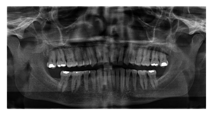
FIGURE 2 Preoperative panoramic radiograph