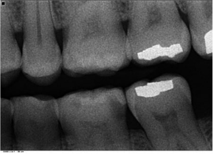
FIGURE 1 Preoperative bite-wing radiographs