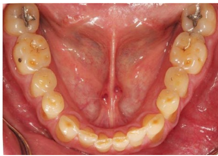
FIGURE 4 Intraoral photograph showing erosion on the incisal and occlusal aspects of the teeth