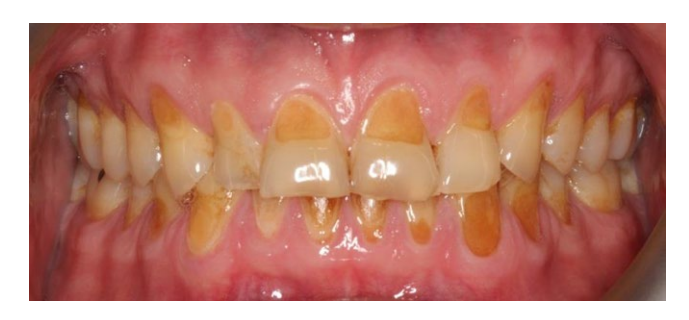
FIGURE 9 Post-treatment photograph at follow-up after 1 year showing extrinsic staining of teeth

The patient was recalled for a follow-up visit after 12 months, the examination revealed extrinsic staining on the teeth (Figure 9), indicating a reduced intake of the erosive agent, that is, Granny Smith apple. Discussion with the patient confirmed that he had reduced his consumption of apples and was following the diet and oral hygiene advice. Dental prophylaxis was performed on the extrinsically stained teeth, and the patient was prescribed a night guard (Figure 10). The teeth were scored again using the BEWE index and assessed for risk levels (Table 6). The examination revealed a consistent total score and risk level highlighting the positive maintenance of the erosive condition.