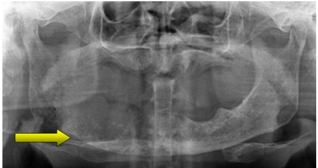
FIGURE 1: Preoperative orthopantomogram showing radiolucent areas in the right body and ramus of the mandible indicating erosions

On intraoral examination, no abnormality of the oral mucosa was detected and the patient was edentulous. Tenderness was elicited on palpating the alveolar mucosa on the right side, up to the retromolar region. The neck was palpated; however, no significant cervical nodes were found. An orthopantomogram was taken which showed a large radiolucency with irregular borders extending from the lower right canine region to the right angle of the mandible (Figure 1).