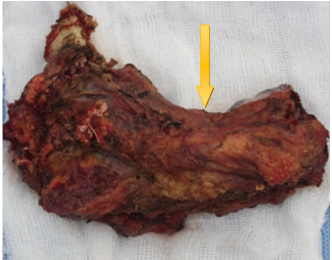
FIGURE 2: Resected mandibular specimen from the right side

The proposed treatment plan was a segmental mandibulectomy of the affected area and intraoperative frozen section, followed by reconstruction using a reconstruction plate. Segmental resection of the mandible from 42 regions up to the right sub-condylar region was performed under general anaesthesia, and the intraoperative frozen section finding was still inconclusive (Figure 2).