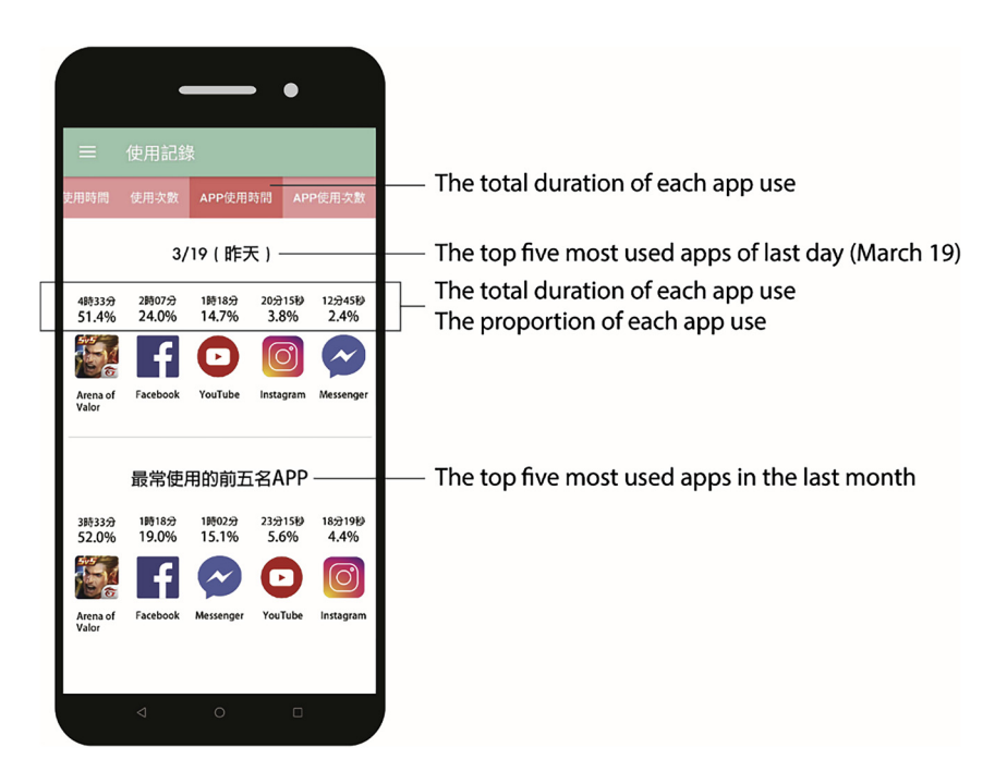
Fig. 2. Screenshot of the "Know Addiction" app user interface, which displays the time spent on each app. This is a screenshot of the "Know Addiction" app user interface from a problematic smartphone user. This app operates in the background and records the screen-on and screen-off timestamps of each app, thus measuring usage. The upper part of the screenshot shows the five most-used apps of the previous day (March 19), including the total duration and proportion of each app use. The lower part of the screenshot shows the five most-used apps of the past four weeks-long period (February 21 to March 19), including the total duration and proportion of each app use. The most-used apps on March 19 were somewhat different from the ranking of the past four months-long period (February 21 to March 19). The third to fifth most-used apps on March 19 were Youtube, Instagram, and Messenger, respectively, while the third to fifth most-used apps over the previous month were Messenger, Youtube, and Instagram, respectively, which reveals fluctuations in mobile apps' usage

Nevertheless, it is conceivable that smartphone users are unable to recall their counts of smartphone-use episodes within a day. A previous study showed that 16.5% of college students' smartphone use was too frequent to estimate its total duration; and the other 83.5% of smartphone users inaccurately estimated time spent on smartphones per week, even with the assistance of psychiatrists' structural interviews (Lin et al., 2015). Two studies have shown significant differences between self-reports and app-recorded time spent on smartphone use (Lin et al., 2015; Montag et al., 2015). In addition, smartphone users with more actual smartphone use would underestimate their use to a greater extent due to "time distortion" effects; the extent of such underestimations has been found to be associated with smartphone addiction (Lin et al., 2015).