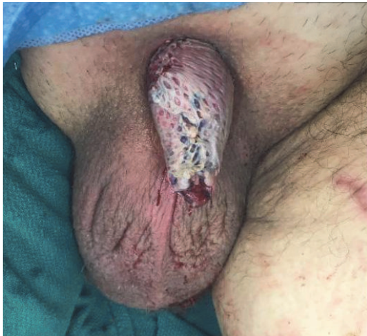
FIGURE 6: Dorsal shaft following placement of split thickness skin graft.

tissue defect around the base of the penis was closed using 4-0 Monocryl interrupted vertical mattress suture. Anchoring sutures were placed at the dorsal base of the penis between Buck's fascia and the dermis of the skin using interrupted 3-0 Vicryl. Length and width of the shaft following closure at the base of the penis measured 7 cm and 9 cm, respectively, resulting in about 1 cm of penile shaft length gained by adding these sutures. We then turned our attention towards the wound coverage. We opted for split thickness skin grafting given the wound bed viable aspect. A rectangular area of the left anterior thigh was chosen as a donor site for skin harvest. Using a dermatome, a split thickness skin graft measuring 0.1 – 0.2 mm in depth, 7 cm in length, and 9 cm in width was harvested. The graft was wrapped around the shaft of the penis and secured into place using anchoring interrupted 4-0 chromic suture (Figures 6 and 7). Once the graft was secured on the shaft of the penis, a new 16 Fr