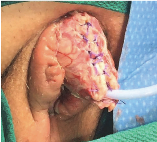
FIGURE 5: Remaining penile shaft after glansectomy and partial penectomy.