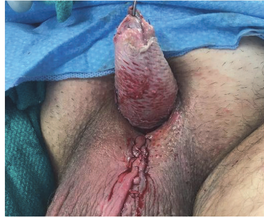
FIGURE 7: Ventral view of shaft following placement of split thickness skin graft.

tissue defect around the base of the penis was closed using 4-0 Monocryl interrupted vertical mattress suture. Anchoring sutures were placed at the dorsal base of the penis between Buck's fascia and the dermis of the skin using interrupted 3-0 Vicryl. Length and width of the shaft following closure at the base of the penis measured 7 cm and 9 cm, respectively, resulting in about 1 cm of penile shaft length gained by adding these sutures. We then turned our attention towards the wound coverage. We opted for split thickness skin grafting given the wound bed viable aspect. A rectangular area of the left anterior thigh was chosen as a donor site for skin harvest. Using a dermatome, a split thickness skin graft measuring 0.1 – 0.2 mm in depth, 7 cm in length, and 9 cm in width was harvested. The graft was wrapped around the shaft of the penis and secured into place using anchoring interrupted 4-0 chromic suture (Figures 6 and 7). Once the graft was secured on the shaft of the penis, a new 16 Fr