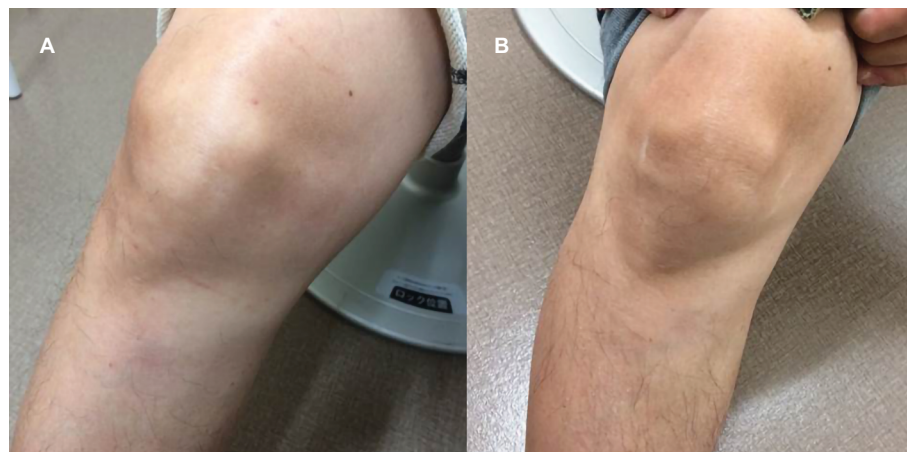
Figure 2 Swelling in the right knee joint (A) and complete healing of the lesion after therapy with ustekinumab (B).

In addition to the characteristic intestinal lesions, IBD is also known to be associated with various extraintestinal manifestations. The reported incidence of extraintestinal manifestations in patients with Crohn's disease ranges from