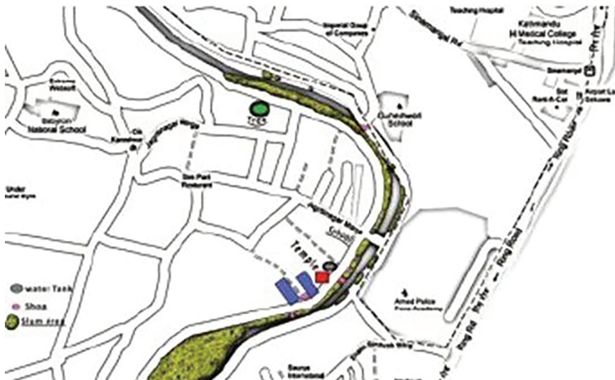
FIGURE 1 Map of the Sinamangal area.

Bivariate analyses were performed to analyze 2 variables using crosstabulations, chi-square tests, and regression analysis. Results were considered to be statistically significant at the 5% level of significance unless otherwise stated. Data is presented visually through figures, frequency tables, and 2 × 2 tables.