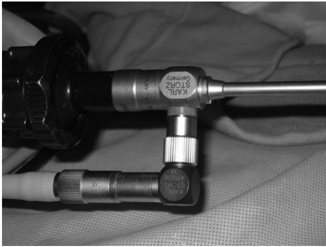
Figure 3. Right angle light cord adaptor used for TEVA excision.

incision laparoscopic surgery. 27 The location of the lesion may influence instrument insertion; the arrangement that provides the most optimal retraction and thorough excision should be used. In addition, alternating retraction and dissection between hands (instruments) eliminates the need for variable patient positioning. Parallel or colinear dissection may be utilized at the surgeon's discretion; however, this may limit the effective working area during the procedure.