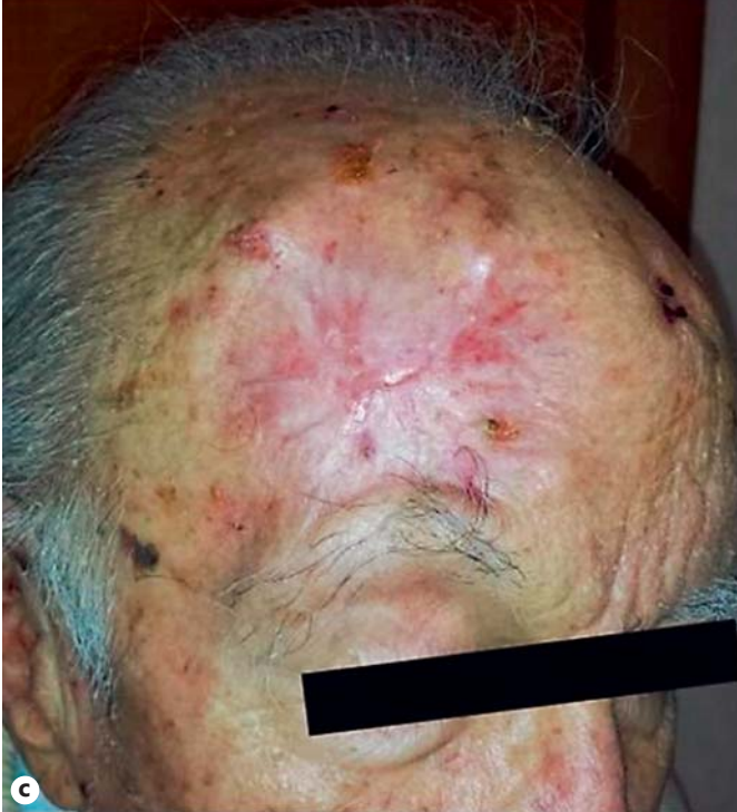
Fig. 1. a Dermal wound after cryotherapy. b Dermal wound after dermal substitute application (Integra<sup>®</sup>). c Complete wound healing (day 90) after treatment with PG.