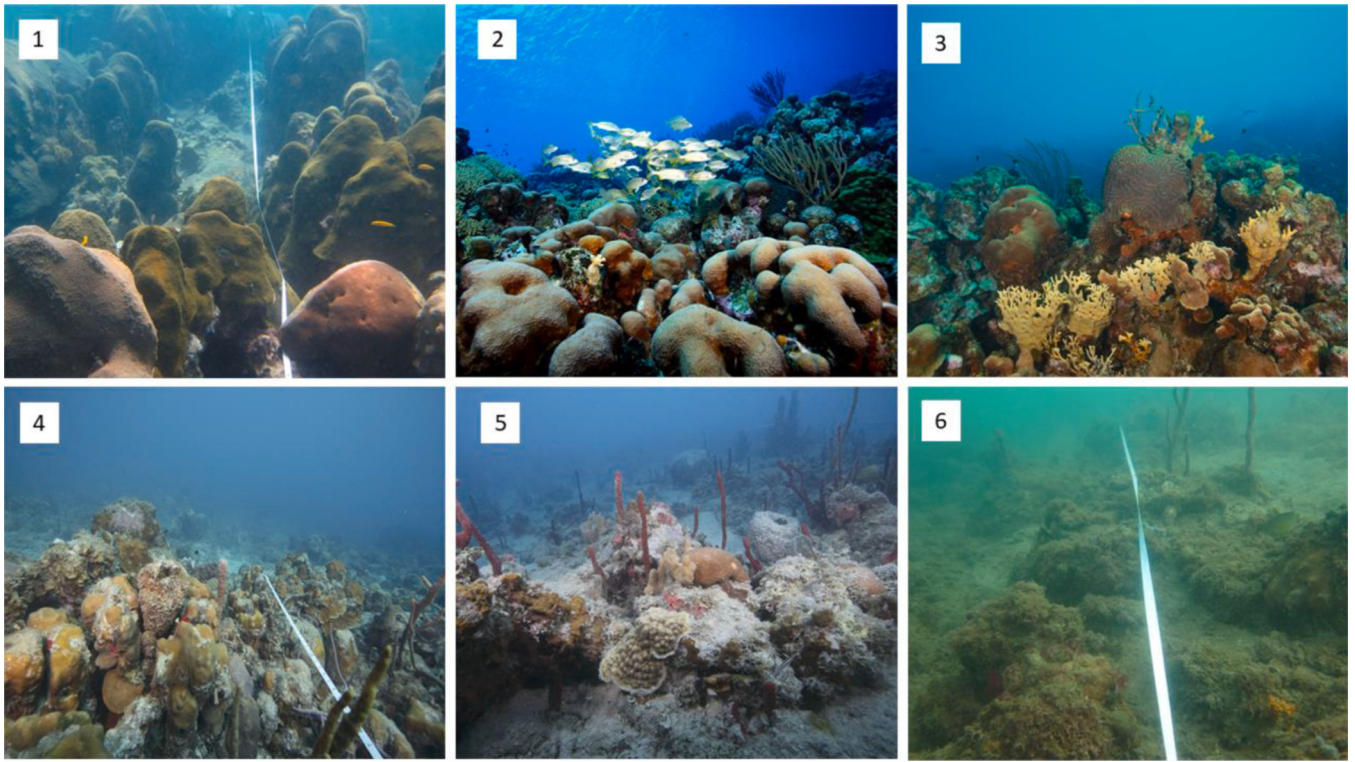
Fig. 2. Examples of reef sites for BCG levels 1–6 (as numbered in figure) that illustrate the characteristics for each narrative BCG level described in Table 5.