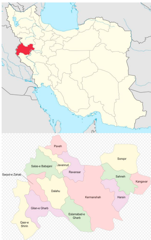
Figure 2. Maps of Iran (up), Kermanshah province and Eslamabad-e Gharb district (down).

stripes of yellow pustules on the leaves for each of three random observations (100 plants per observation) per plot. The disease severity was determined as the percentage of leaf area postulating for the three youngest leaves (3–5 plants per plot). According to the highest disease severity rated over the four growing seasons from 2013–2017, the classification of stripe rust resistance level for the eight wheat cultivars was reconsidered as follows: semi-resistant for cv. Pishgam (<30%) and susceptible (>40%) for cvs. Bahar, Baharan, Chamran II, Parsi, Pishtaz, Sirwan, and Sivand.